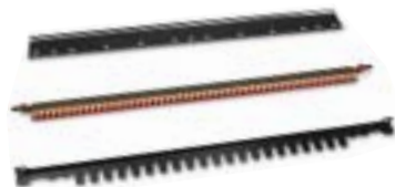
Comb kit, scrapers, HD bedknife