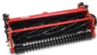
69 cm (27") 11-blade cutting unit